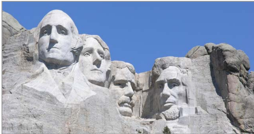
Mt. Rushmore National Monument located near Rapid City, South Dakota