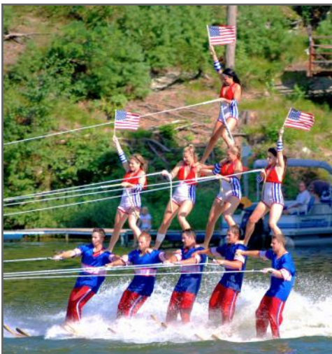
The Tommy Bartlett Ski Show is a "must see" while at the Dells.

This reunion promises to be a great one. Reunion schedule and registration information is on page 6 and 7.