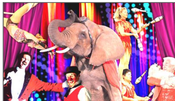
Circus World in Baraboo is much more than a museum. It features circus acts and has the largest collection of circus wagons in the world.

Our headquarter hotel is the Best Western-Baraboo Inn, just minutes south of the Dells.