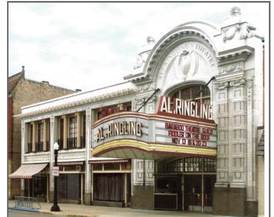
This spectacular theatre was built in 1915 by circus showman Al Ringling. It has been restored and is open to the public. Demonstrations of its Mighty Barton Pipe Organ are performed daily.

More questions? Visit www.windemuth.org or contact Jim Wintermute at: jwintermute@windemuth.org