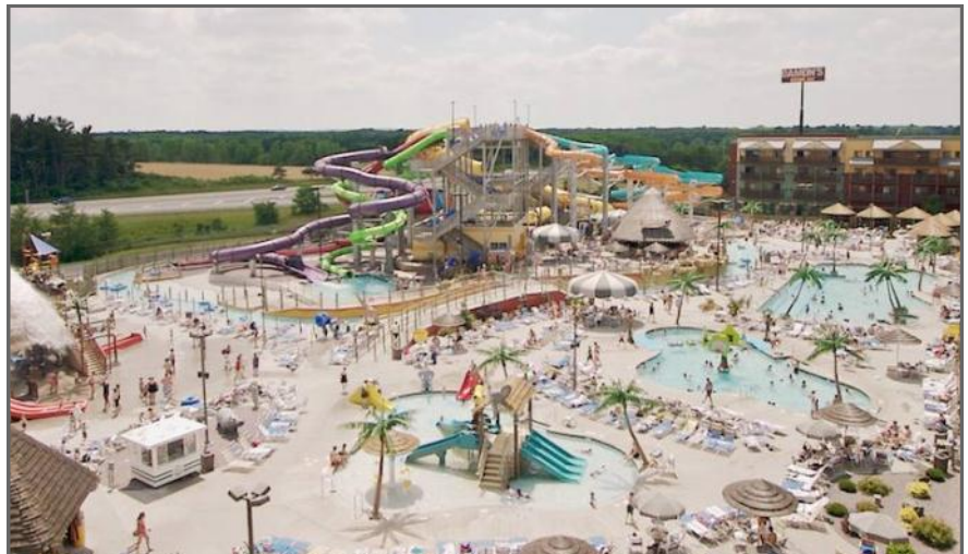
One of the many water parks that offers endless entertainment for young and old alike. The Dells is known as the Water Park Capital of the World.