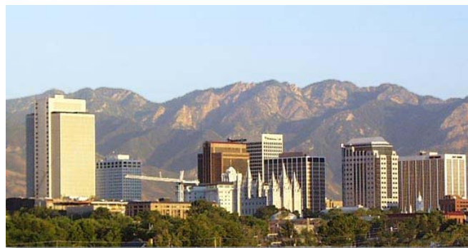
Skyline of Salt Lake City ▲

Every Windemuth descendent is invited to attend the 2007 biennial Windemuth International Family Reunion! It will be held