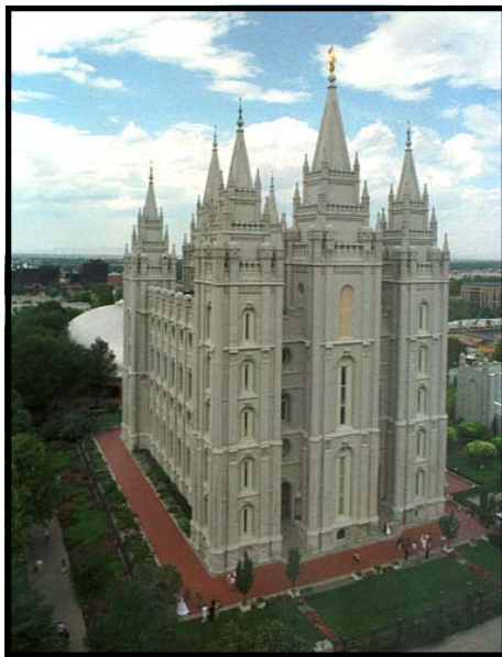
◀ LDS Temple

The August 1- 3, 2007 Reunion Promises a Great Time for All!