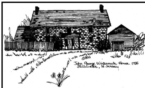
Sketch of the "Old Stone House" by Sadie Hill in 1974