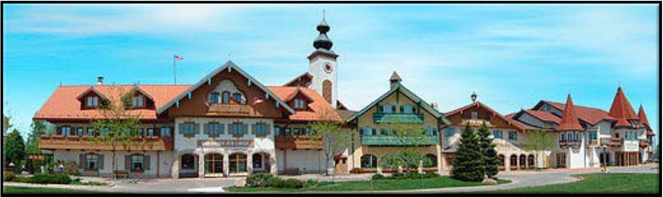
Bavarian Inn Lodge at Frankenmuth, Michigan Headquarter hotel for the 2005 International Reunion