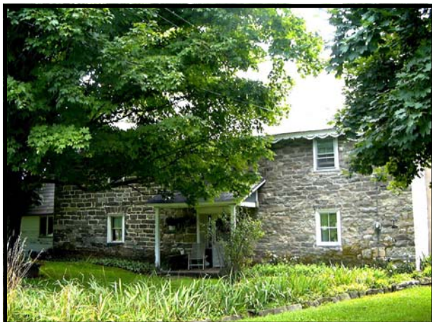
The above photos by Tom Cooper in June 2004