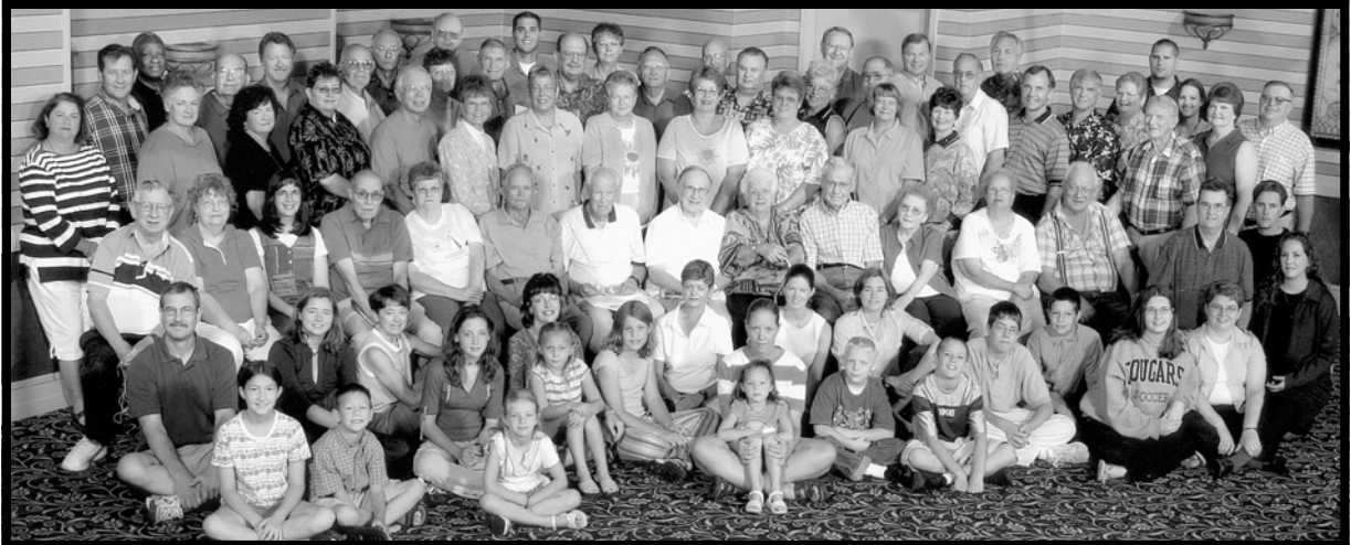
Group Photo of Family Members at the 2003 reunion in Walnut Creek, California