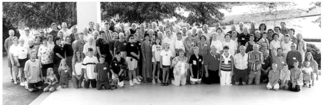
105 Family Members Attended the 2001 Reunion in Branson Missouri