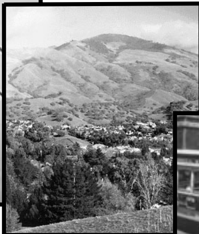
< Walnut Creek, CA