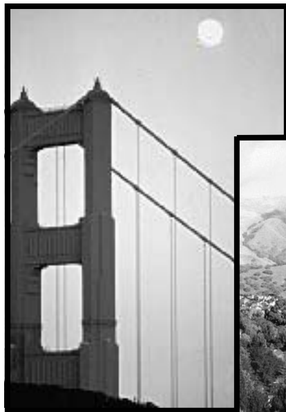
< Golden Gate Bridge

We're on the Web: www.kern.com/maykoski/wintermute.htm www.jefnet.com/wintermute