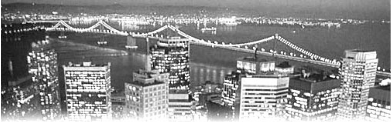
San Francisco at night, site of the 2003 Windemuth Family Reunion