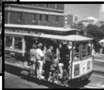
< Cable Car